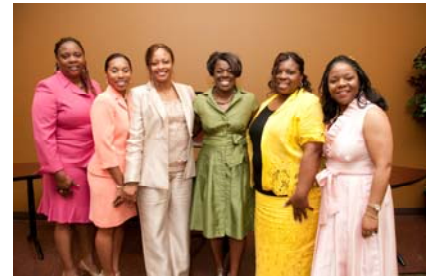
MSK Leadership and Life Coaching Coaches