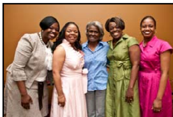
MSK Board Members and MGB Second Chance Award Honoree - From Left to Right