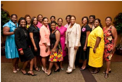
2008 & 2009 MSK Leadership & Life Coaching Program Focus Group Alumni

SMAP, Holiday Social - Cappuccino and Conversation (Location TBD)